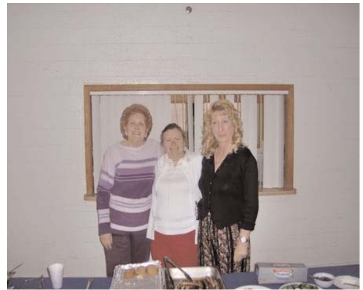
A delicious breakfast was prepared and served by our fantastic kitchen crew