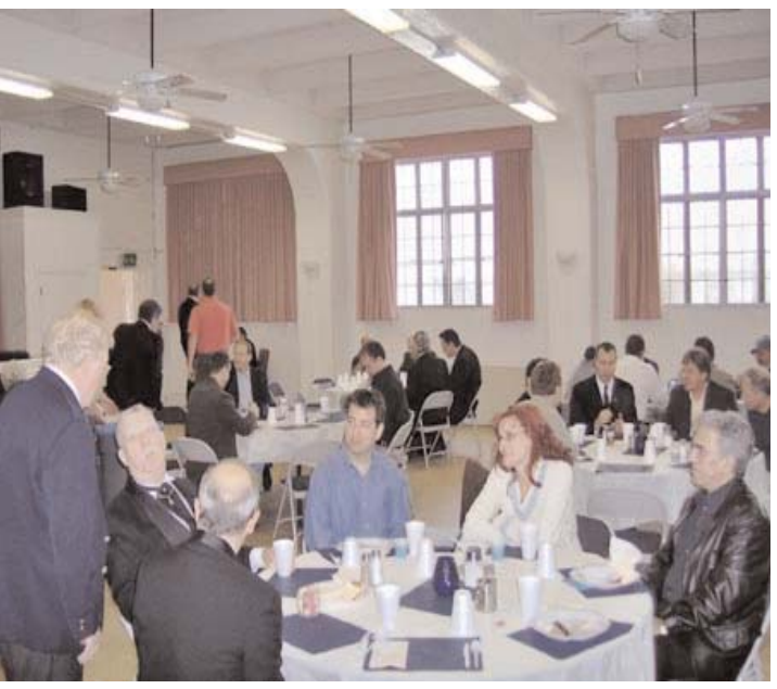
Masons ate with and talked to the guests before going up to the Lodge room to hear the speakers. Masons from various Lodges joined Culver City Foshay Lodge for our first Masonic Seminar