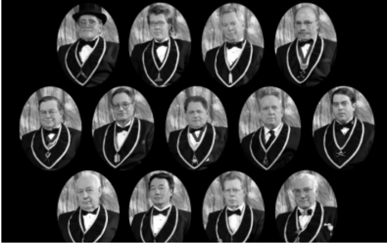
Culver City Foshay Lodge #467 F.U.M. 2007 Officers