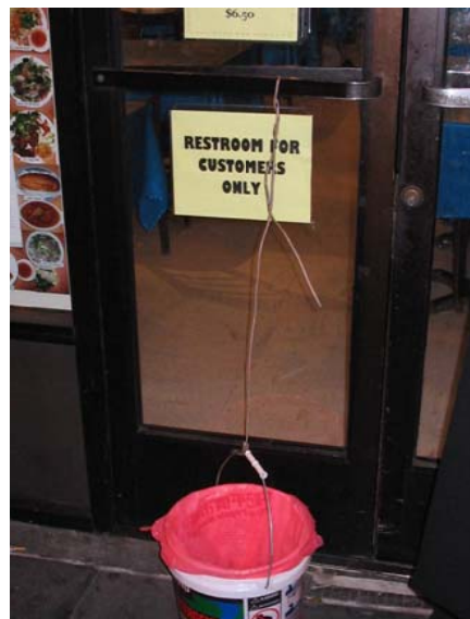
The restroom next to the restaurant