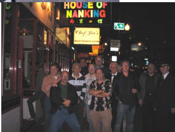
Can anyone tell us how to get to Grand Lodge, we're lost!