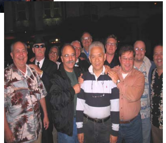
We had to take him out in back and knock some sense into him.