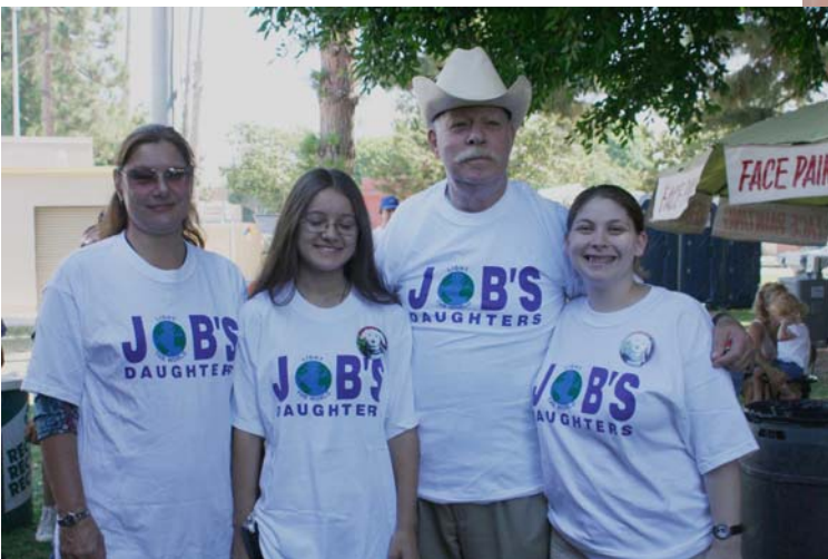
The brethren and Job's Daughters met at Veteran's Park in August for our annual Child ID Program