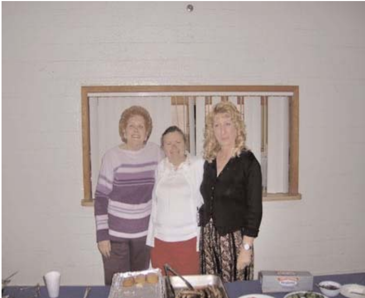
A delicious breakfast was prepared and served by our fantastic kitchen crew